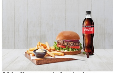
CCA offer access to free business promotion tools

Coca-Cola (CCA) have designed a digital and social content portal for its customers, aimed at providing a one-stop shop for professional social and digital content to help them attract more business. It allows customers to download free professional imagery and access tools aimed at optimising their online presence.